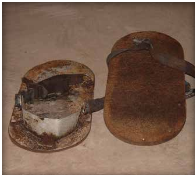
Figure 15. Walking on the hot bitumen-sand bedding with regular construction grade, steel-toed boots is discouraged. For limited walking on this layer, workers should wear boot sole covers shown here that resist damage and better distribute weight to prevent dentations.