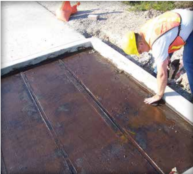
Figure 3. Confirming the tack coat has cured and is no longer wet to the touch.