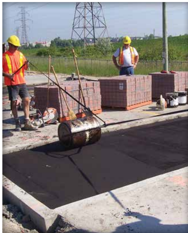
Figure 14. A water-filled roller compactor for compacting the bitumen-sand bedding.

ers are in place including cut units, sand is swept into the joints and pavers are compacted until the joints are full (Figures 11 and 12). For more efficient work, sand sweeping and compaction can be simultaneous. Unlike sand-set pavers, there is no need to compact the pavers without sand in the joints first. When completed, the pavement can accept traffic loading immediately (Figure 13).