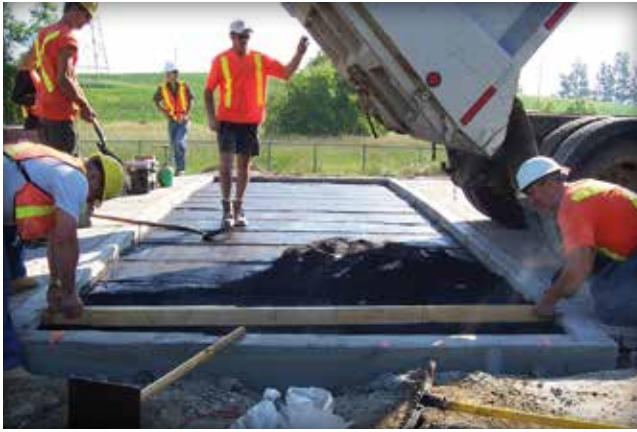
Figure 4. The hot bitumen-sand bedding material is dumped from a truck onto the concrete base.