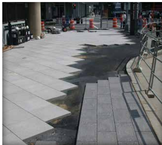
Figure 18. Paving slabs adhered to a bitumen-sand bedding in a Washington, DC, sidewalk.