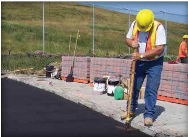
Figure 6. A hand tamper is used to compact in areas that cannot be reached with the roller compactor.