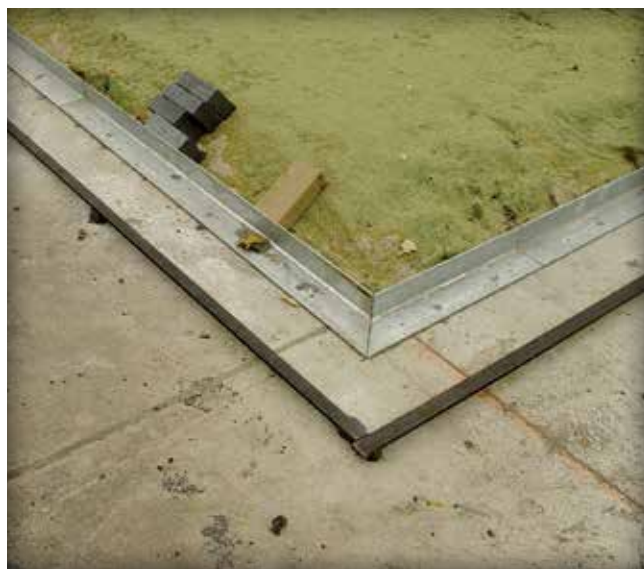
Figure 17. On larger projects, thick steel screed bars are placed on the concrete base to ensure a uniform bitumen-sand bedding thickness.