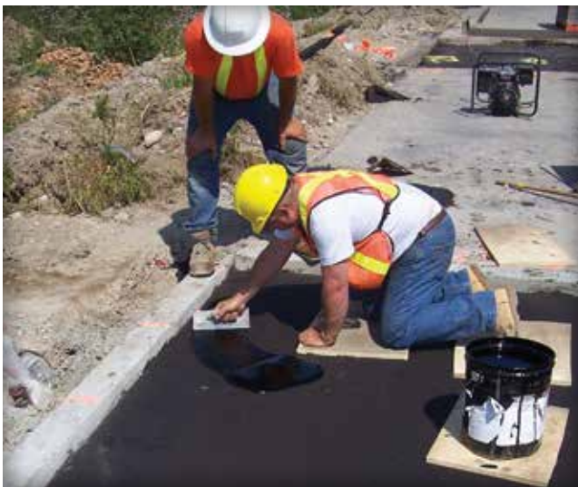
Figure 8. After the bitumen-sand mix cools, a 2% neoprene-asphalt adhesive is applied. The material can be trowel-applied as shown here. Adhesives with a lower viscosity can be spread with a squeegee.