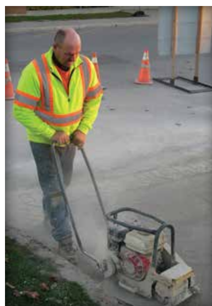
Figure 12. Once the pavers are in place, the joints are filled with dry joint sand and the surface is compacted.

A thin layer of neoprene-asphalt adhesive is then applied with a squeegee to the top of the bedding layer, and allowed to cure (typically 1 to 2 hours). Adhesives with a high viscosity are applied with a straight edged towel as shown in Figure 8. Adhesives with a low viscosity can be applied with a squeegee. The adhesive takes a hazy appearance when ready to mark baselines and place the concrete pavers (Figure 9). Only enough adhesive should be applied that will be covered with pavers in a day's work. Figure 10 shows the paver installation. Once the pavers are placed on the adhesive, they are very difficult to remove. If removed, they can pull up the adhesive and bitumen-sand bedding under the paver. Once all the pav-