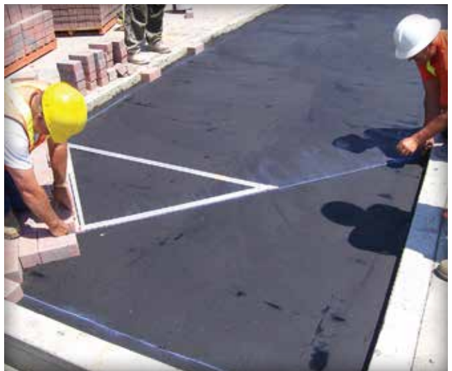
Figure 9. Perpendicular chalk lines are snapped and the pavers placed on the adhesive after the neoprene-asphalt adhesive dries (cloudy black surface).