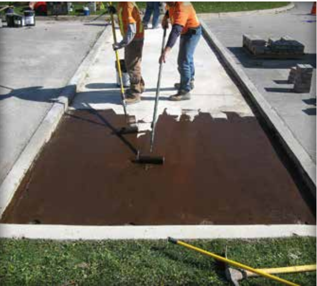
Figure 2. Emulsified asphalt tack coat is applied to a concrete base prior to applying the bitumen-sand mix.