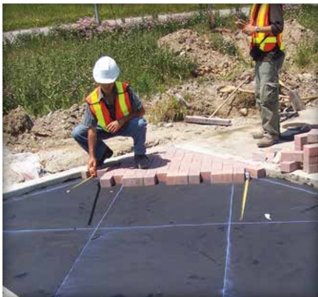
Figure 10. Cut pavers are added along the edges.

Best application results are typically achieved using a synthetic paint roller with a short nap. Once applied the tack coat should not be disturbed and should be allowed to cure before covering with the setting bed material. As the asphalt emulsion cures it should turn from a brown to black color (Figure 3). This may take a few hours depending on weather conditions. When using SS-1 and SS-1h asphalt emulsions the temperature should be between 70 and 160° F (20 to 70° C) to allow for proper curing. Asphalt tack coats are recommended for vehicular applications. They are typically not required in pedestrian applications.