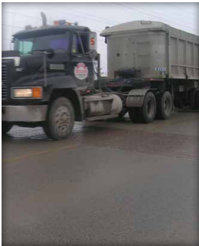
Figure 13. Crosswalk in use under heavy traffic.