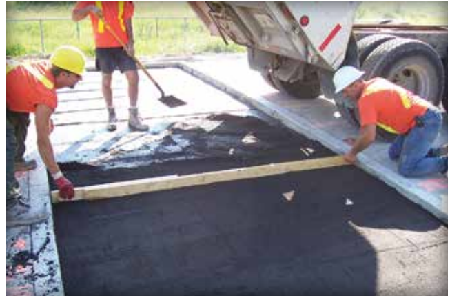
Figure 5. While the bitumen-sand is still hot, it is screeded to an uncompacted thickness of about \frac{3}{4} in. (20 mm).