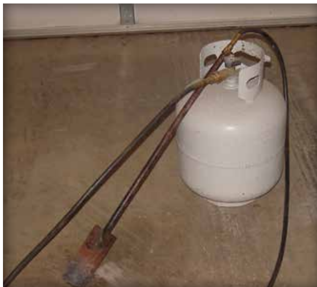
Figure 16. Occasionally, uneven bedding surface occurs and it is necessary to re-heat the bitumen-sand bedding with a propane heater tool.