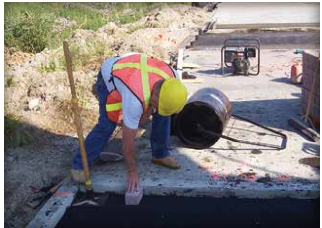
Figure 7. The compacted bedding elevation at the edge is checked with a paver.