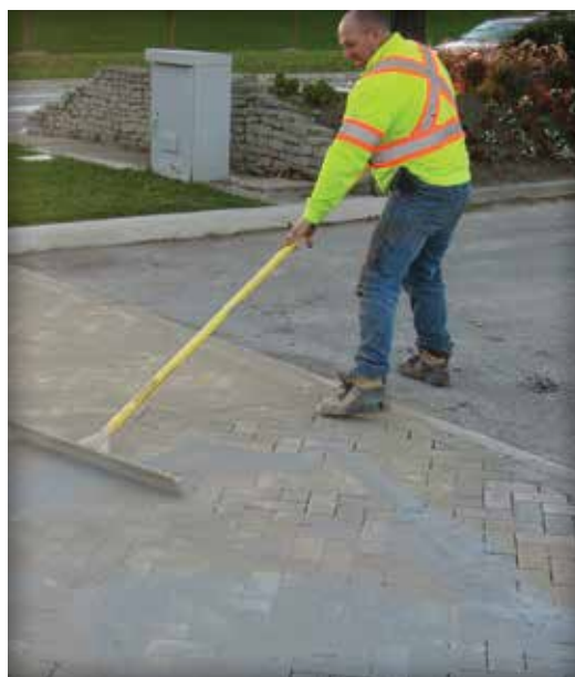
Figure 11. Sweeping in joint sand

The hot bitumen-sand bedding layer is placed, screeded to about \frac{3}{4} in. (20 mm) thick and compacted while remaining above 250° F (120° C) (Figures 4 and 5). This layer typically compacts about \frac{1}{8} in. (3 mm). The depth of this layer must be consistent. If the area does not have a curb to support a screed, screed bars are placed directly on the concrete base to guide the screed.