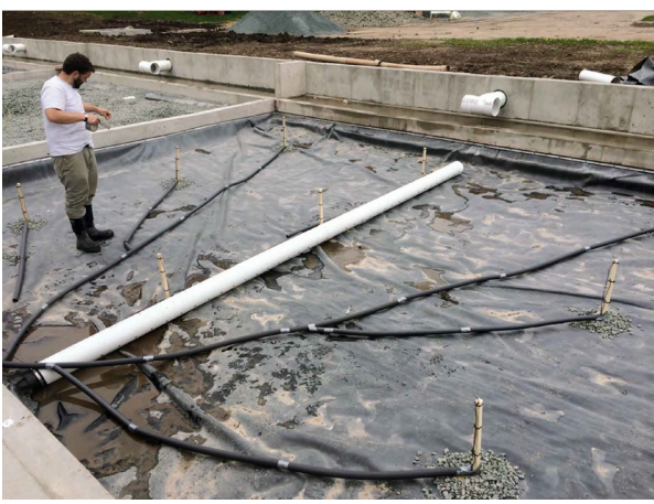
Installation of temperature sensors.

Previous research papers authored by the principal investigator indicated substantial pollutant reductions from these no-infiltration permeable pavements. This expanded their use by the Wisconsin Department of Natural Resources. The papers indicated that the assemblies included sensors placed at the top, middle, and bottom of these three pavements to measure temperature. This provided an investigative opportunity. See the two figures below.