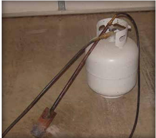
Figure 16. Occasionally, uneven bedding surface occurs and it is necessary to re-heat the bitumen-sand bedding with a propane heater tool.