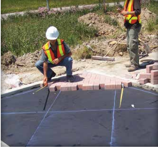
Figure 10. Cut pavers are added along the edges.

Best application results are typically achieved using a synthetic paint roller with a short nap. Once applied the tack coat should not be disturbed and should be allowed to cure before covering with the setting bed material. As the asphalt emulsion cures it should turn from a brown to black color (Figure 3). This may take a few hours depending on weather conditions. When using SS-1 and SS-1h asphalt emulsions the temperature should be between 70 and 160° F (20 to 70° C) to allow for proper curing. Asphalt tack coats are recommended for vehicular applications. They are typically not required in pedestrian applications.