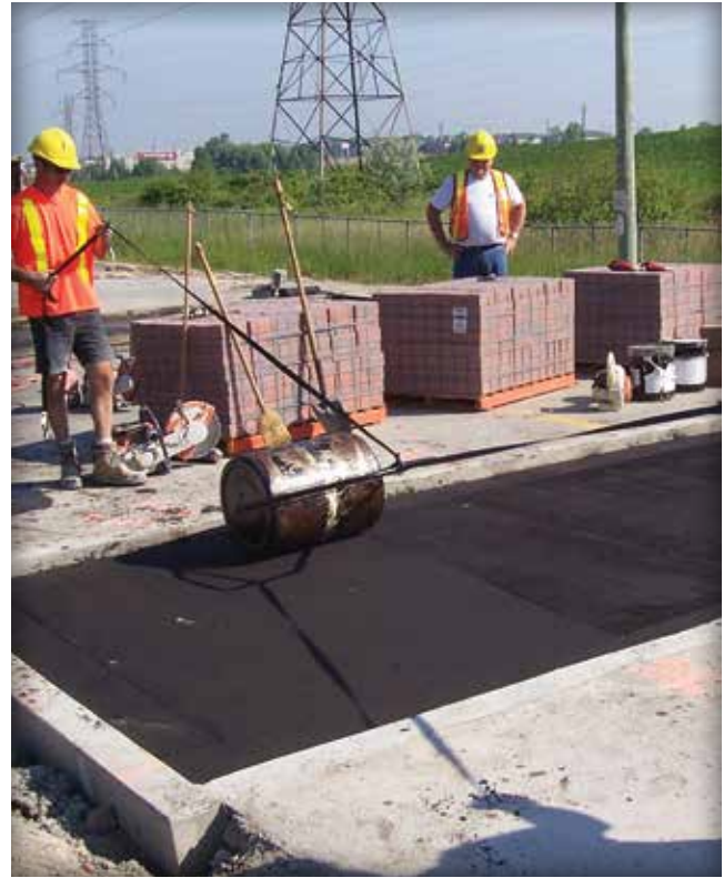
Figure 14. A water-filled roller compactor for compacting the bitumen-sand bedding.

Specialty Tools —Some specialty tools are required to successfully install bitumen-sand set pavers. For example, Figure 14 shows a roller modified with a long handle welded or bolted to the frame. The drum of the roller should be smooth with no rust, preferably with sharp edges (not rounded). Other specialty tools are shown in Figures 15, 16 and 17.