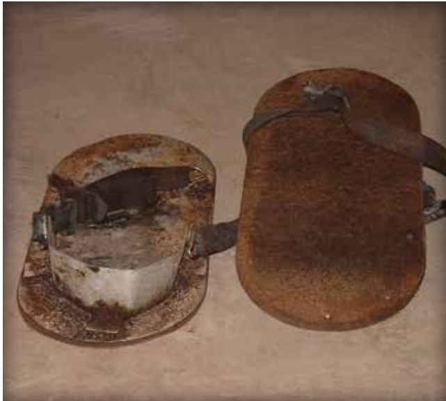
Figure 15. Walking on the hot bitumen-sand bedding with regular construction grade, steel-toed boots is discouraged. For limited walking on this layer, workers should wear boot sole covers shown here that resist damage and better distribute weight to prevent dentations.