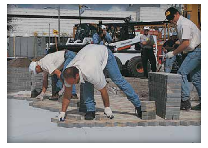
Figure 7. Placing the concrete pavers.

Edge restraints are a key part of interlocking concrete pavements. By providing lateral resistance to loads, they maintain continuity and interlock among the paving units. Aluminum, steel, plastic, or concrete are typical edge restraints. Consult ICPI Tech Spec 3 on edge restraints for recommendations on applications and construction.