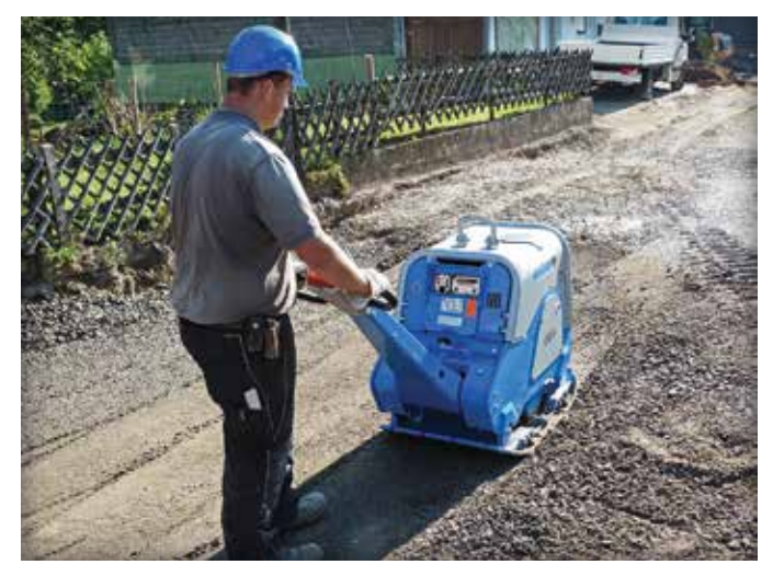
Figure 4. Base compaction with a reversible plate compactor.

When the fabric is placed in the excavated area, it should be turned up along the sides of the opening, covering the sides of the base layer. There should be no wrinkles on the bottom. When the aggregate is dumped on the fabric, the tires from trucks should be kept off the fabric to prevent wrinkling.