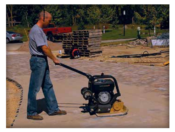
Figure 11. Vibrating sand into the joints.

screeded it should not be disturbed. Sufficient sand is placed and screeded to stay ahead of the placed pavers. Powered screeding machines that roll on rails and asphalt spreading machines adapted for screeding sand have been successfully used on larger installations to increase productivity.