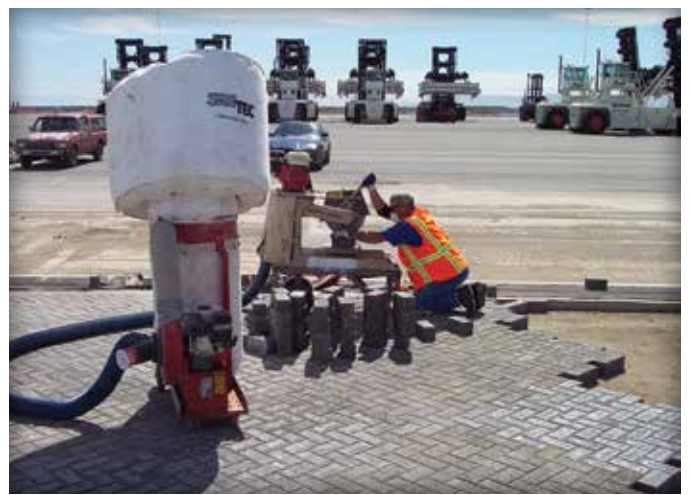
Figure 8. Saw cutting pavers.