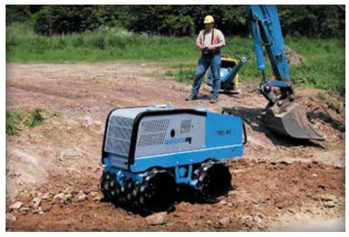
Figure 2. Compacting the soil subgrade.

economical. Refer to Tech Spec 11–Mechanical Installation of Interlocking Concrete Pavements for additional information.