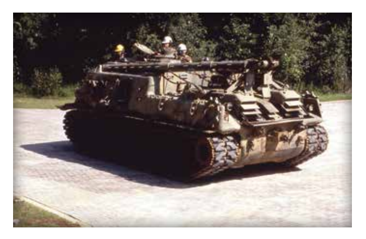
Figure 13. The completed paved area from Figure 12 receives tank traffic at the U.S. Army Proving Grounds in Aberdeen, Maryland.

ICPI Tech Spec 9–A Guide Specification for the Construction of Interlocking Concrete Pavement helps translate construction methods and procedures described here into a construction document. Tech Spec 9 provides a template for developing project-specific materials and installation specifications for the bedding and joint sand, plus the concrete pavers. Consult the Construction Tolerances and Recommendations for Interlocking Concrete Pavements for the list of recommended tolerances. Additional guide specifications and detail drawings for varioius applications are available at www.icpi.org as well as ICPI Tech Specs. Other ICPI Tech Specs and technical manuals should be referenced for information on design, detailing, construction and maintenance.