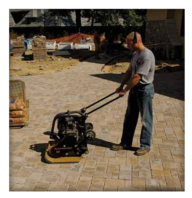
Figure 9. Compacting the pavers and bedding sand.

Edge restraints must be set at the correct level, especially if the tops of the restraints are used for screeding the bedding sand. Their elevations should be checked prior to placing the sand and pavers. A minimum of 1 in. (25 mm) vertical restraining surface should be in contact with the side of the paver to adequately restrain it. For heavy duty application a greater restraining surface may be warranted. Edge restraints are typically installed before the bedding sand and pavers are laid. However, some restraints can be secured into the base as the laying progresses.