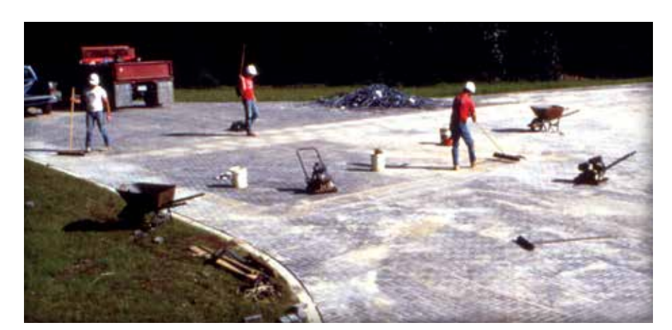
Figure 12. Removing excess sand from the finished surface will make the pavement ready for traffic.

Final surface elevations should not vary more than \pm^{3}/_{8} in. ( \pm 10 mm) under a 10 ft (3 m) straightedge, unless otherwise