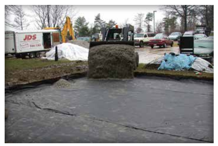
Figure 3. Application of the geotextile under aggregate base.

Typical 4 in. (100 mm) diameter perforated drainage pipes surrounded with minimum 3 in. (75 mm) of No. 57 or similar open-graded stone is wrapped in woven or non-woven geotextile as specified by the designer.