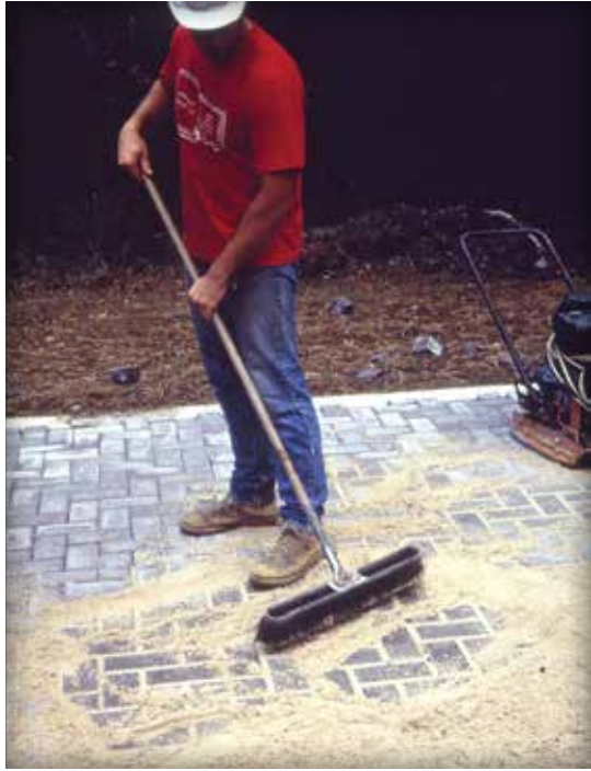
Figure 10. Spreading the joint sand.

sand. Masonry sand for mortar should never be used for bedding, nor should limestone screenings or stone dust. The bedding sand should have symmetrical particles, generally sharp, washed, with no foreign material. Waste screenings and stone dust should not be used, as they often do not compact uniformly and can inhibit lateral drainage of moisture in the bedding layer. ICPI Tech Spec 17—Bedding Sand Selection for Interlocking Concrete Pavements in Vehicular Applications provides additional guidance on selecting bedding sand and gradations including limits on material passing the No. 200 (0.075 mm) seive. See Table 5.