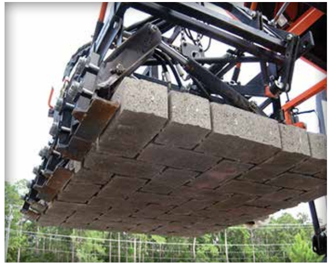
Figure 3. A cluster of pavers (or layer) is grabbed for placement by mechanical installation equipment. The pavers within the cluster are arranged in the final laying pattern as shown under the equipment.

A key component in the plan is a method statement by the manufacturer that demonstrates control of paver dimensional tolerances. This includes a plan for managing dimensional tolerances of the pavers and clusters so as to