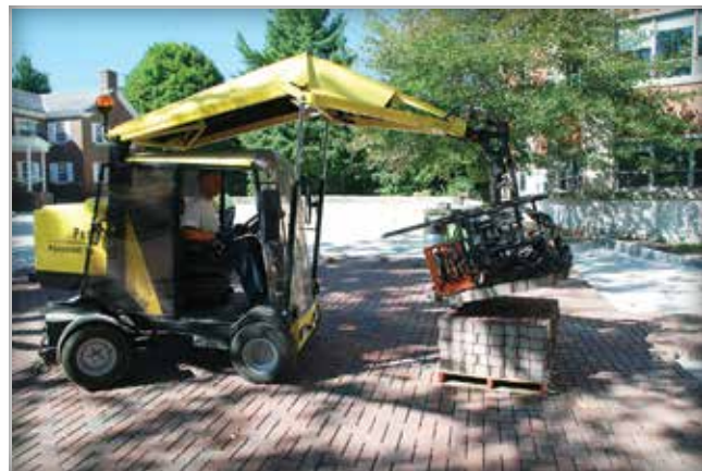
Figure 1. Mechanical installation of interlocking concrete pavements (left) and permeable units (right) is seeing increased use in industrial, port, and commercial paving projects to increase efficiency and safety.