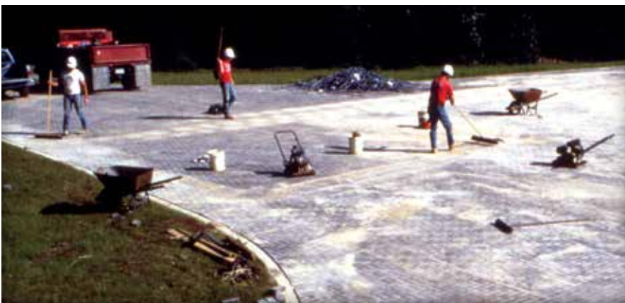
Figure 12. Removing excess sand from the finished surface will make the pavement ready for traffic.

Concrete pavers can be placed in many patterns depending on the shapes. Herringbone patterns (45 or 90 degree) are recommended in all street applications, as these interlocking patterns provide the maximum load bearing support, and resist creep from starting, braking and turning tires. See Figure 7. ICPI takes a conservative approach by not recognizing differences among paver shapes with respect to structural and functional performance. Certain manufacturers may have materials and data that discuss the potential benefits of shapes on functional and structural performance in vehicular applications. Chalk lines snapped on the bedding sand or string lines pulled across the surface of the pavers are used as a guide to maintain straight joint lines. Buildings, concrete collars, inlets, etc., are generally not straight and should not be used for establishing