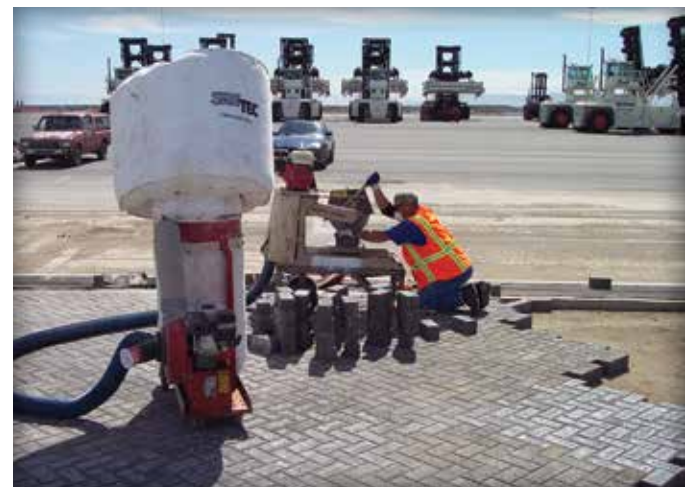
Figure 8. Saw cutting pavers.