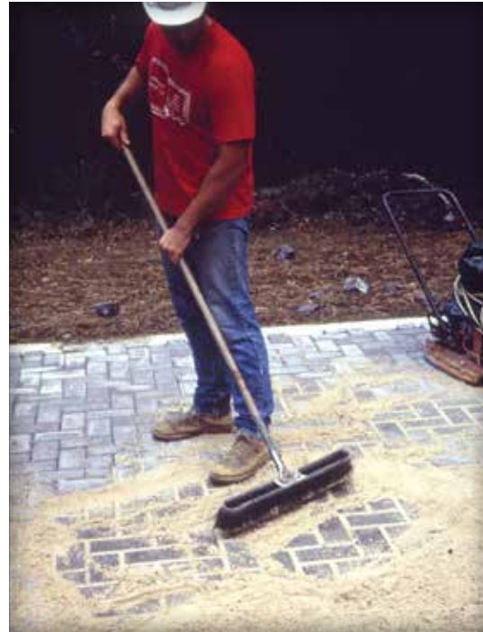
Figure 10. Spreading the joint sand.

Edge restraints must be set at the correct level, especially if the tops of the restraints are used for screeding the bedding sand. Their elevations should be checked prior to placing the sand and pavers. A minimum of 1 in. (25 mm) vertical restraining surface should be in contact with the side of the paver to adequately restrain it. For heavy duty application a greater restraining surface may be warranted. Edge restraints are typically installed before the bedding sand and pavers are laid. However, some restraints can be secured into the base as the laying progresses.