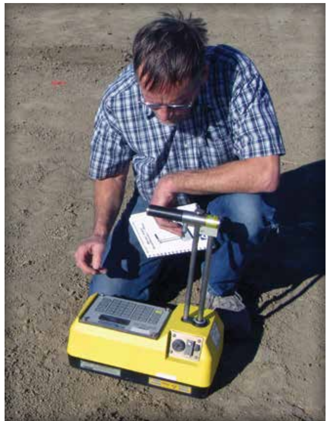
Figure 5. Density testing of the aggregate base with a nuclear density gauge.

Many localities determine base thickness with the 1993 Guide for the Design of Pavement Structures published by the American Association of State Highway and Transportation Officials (AASHTO). The AASHTO procedure calculates the structural number (SN) of the strength coefficients of each base and pavement layer. The SN is determined by assessing the traffic loads, soils, and environmental factors (e.g., drainage, freeze-thaw). The layer coefficient recommended for 3 1 / 8 in. (80 mm) thick pavers on 1 in. (25 mm) bedding sand is 0.44 per inch (25 mm), i.e., the SN = 4^{1/8} \times 0.44 = 1.82 . Base thicknesses can be readily deter-