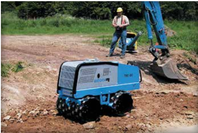
Figure 2. Compacting the soil subgrade.