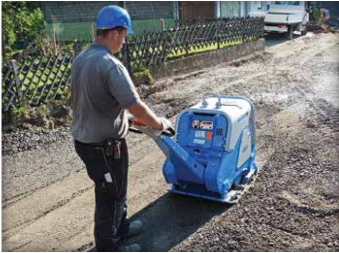
Figure 4. Base compaction with a reversible plate compactor.

When the fabric is placed in the excavated area, it should be turned up along the sides of the opening, covering the sides of the base layer. There should be no wrinkles on the bottom. When the aggregate is dumped on the fabric, the tires from trucks should be kept off the fabric to prevent wrinkling.