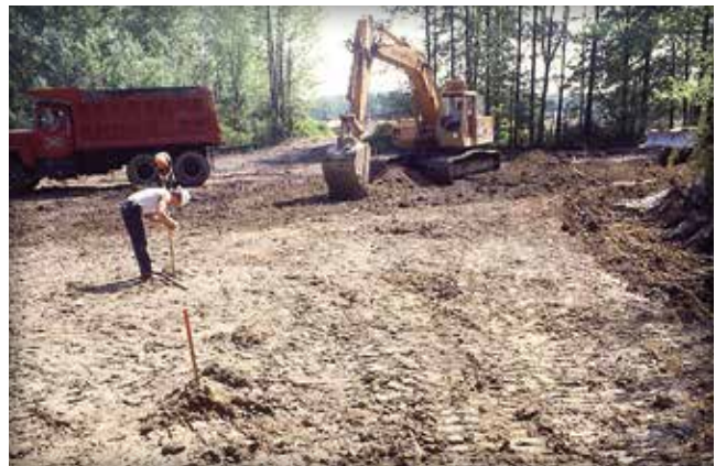
Figure 1. Excavation of the soil subgrade and placing grade stakes.

Installation steps include job planning, layout, excavating and compacting the soil subgrade, applying geotextiles (optional), spreading and compacting the sub-base and/or base aggregates, constructing edge restraints, placing and screeding the bedding sand, and placing concrete pavers. For larger installations mechanical placement of pavers may be more