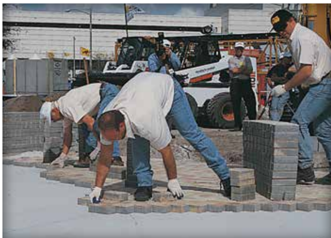
Figure 7. Placing the concrete pavers.

Edge restraints are a key part of interlocking concrete pavements. By providing lateral resistance to loads, they maintain continuity and interlock among the paving units. Aluminum, steel, plastic, or concrete are typical edge restraints. Consult ICPI Tech Spec 3 on edge restraints for recommendations on applications and construction.