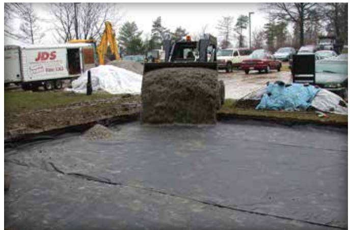
Figure 3. Application of the geotextile under aggregate base.

economical. Refer to Tech Spec 11–Mechanical Installation of Interlocking Concrete Pavements for additional information.