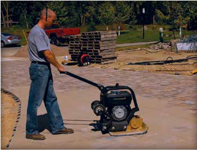
Figure 11. Vibrating sand into the joints.

screeded it should not be disturbed. Sufficient sand is placed and screeded to stay ahead of the placed pavers. Powered screeding machines that roll on rails and asphalt spreading machines adapted for screeding sand have been successfully used on larger installations to increase productivity.