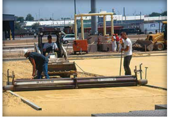
Figure 6a & 6b. Screeding the bedding sand.

mined by using the charts in ICPI Tech Spec 4—Structural Design of Interlocking Concrete Pavement for Roads and Parking Lots or ICPI Structural Design Software . This software is available for free download on www.icpi.org .