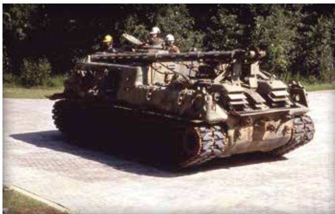
Figure 13. The completed paved area from Figure 12 receives tank traffic at the U.S. Army Proving Grounds in Aberdeen, Maryland.

ICPI Tech Spec 9—A Guide Specification for the Construction of Interlocking Concrete Pavement helps translate construction methods and procedures described here into a construction document. Tech Spec 9 provides a template for developing project-specific materials and installation specifications for the bedding and joint sand, plus the concrete pavers. Consult the Construction Tolerances and Recommendations for Interlocking Concrete Pavements for the list of recommended tolerances. Additional guide specifications and detail drawings for various applications are available at www.icpi.org as well as ICPI Tech Specs. Other ICPI Tech Specs and technical manuals should be referenced for information on design, detailing, construction and maintenance.