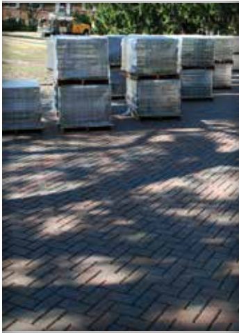
Figure 2. Bundles of ready-to-install pavers for setting by mechanical equipment. Bundles are often called cubes of pavers.

sand stabilization materials. ICPI Tech Spec 11–Mechanical Installation of Interlocking Concrete Pavements (ICPI 2015) should be consulted for additional information on design and construction with this paving method. Other references include American Society for Testing and Materials or the Canadian Standards Association for the concrete pavers, sands, and joint stabilization materials, if specified. Placement of the base, drainage and related